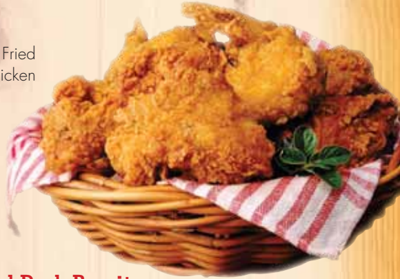
Southern Fried Chicken

The King of Steaks! 20oz. of seasoned perfection grilled on our wood burning grill 35.95