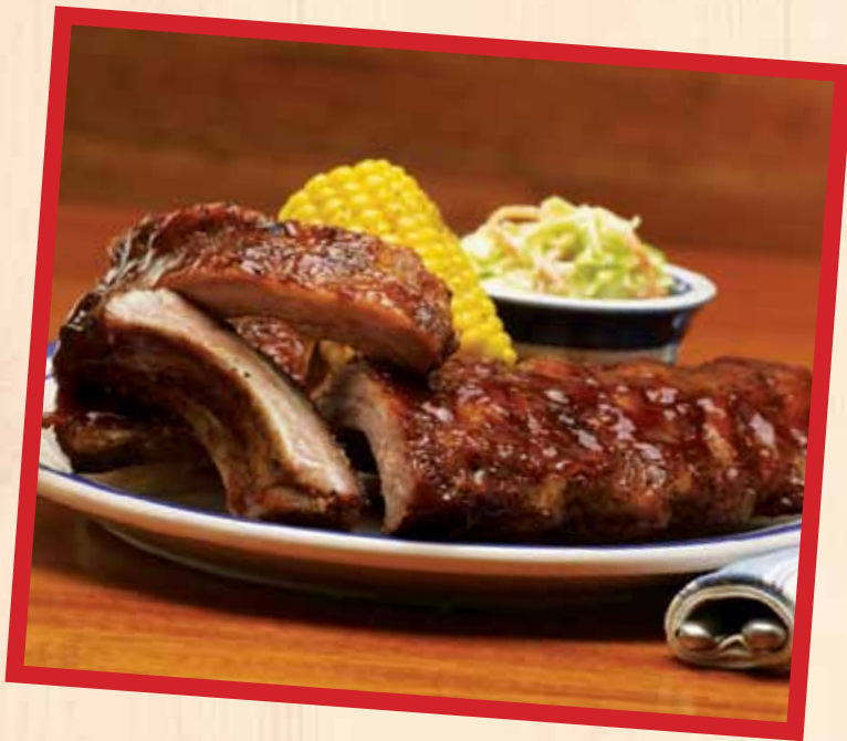
Baby Back Ribs

Braised in apple juice and finished in our smoker, a serious hunk of meat 18.95