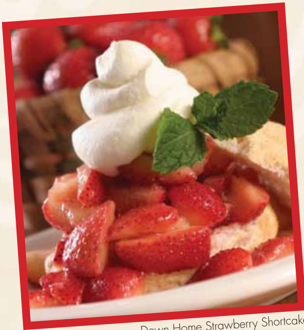
Down Home Strawberry Shortcake

Vanilla bean ice cream and old fashioned Mug Root Beer topped with Heath Bar Crunchies 6.95