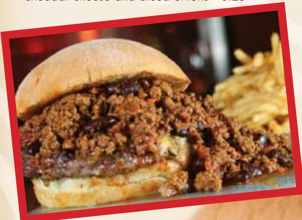
Chili Cheese Burger

Meatless patty with boursin cheese, grilled onions and peppers on a whole wheat bun 15.50