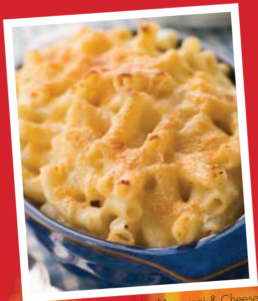
Two Cheddar Macaroni & Cheese