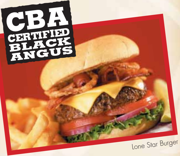
Lone Star Burger

Bacon, your choice of cheese on custom made bun 15.95