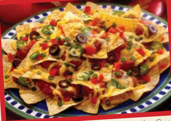
Texas Nachos Grande

A taste of some of our favorite menu teasers. Buffalo wings, onion rings, chicken tenders and hush puppies 15.95